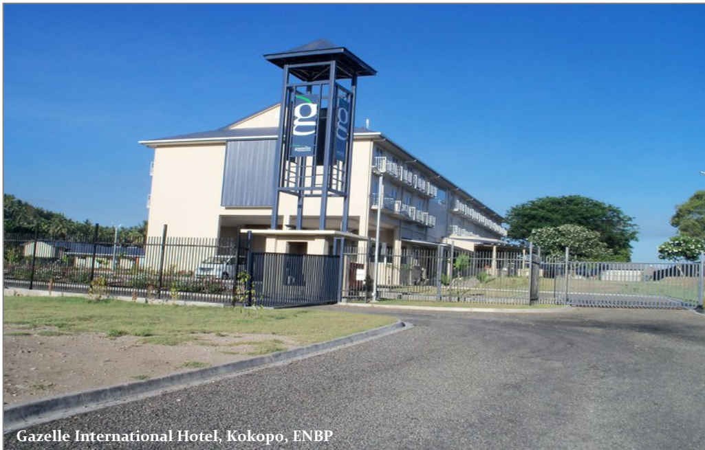
Gazelle International Hotel, Kokopo, ENBP