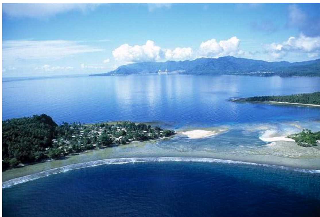
Malie Island with the Newcrest Gold Mine operations on Lihir in the background. Malie is one of four islands that form the Lihir group. The others include Masahet, Mahur and Lihir or Niolam as it is known locally.

“Create the wealth required to provide economic benefits and financial independence that will support the welfare and standard of living of all Lihirians following the closure of the Lihir gold mine.”