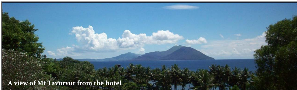
A view of Mt Tavurvur from the hotel